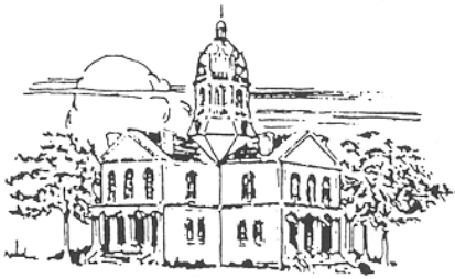
Courthouse at Winterset Madison County, Iowa Built in 1876 of native limestone.